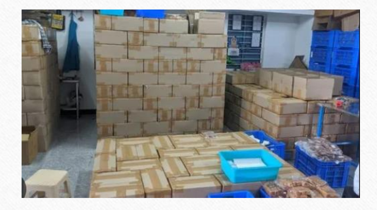
Hygienic Storing Facility

www.growindiagoc.com nareshg@growindiagoc.com