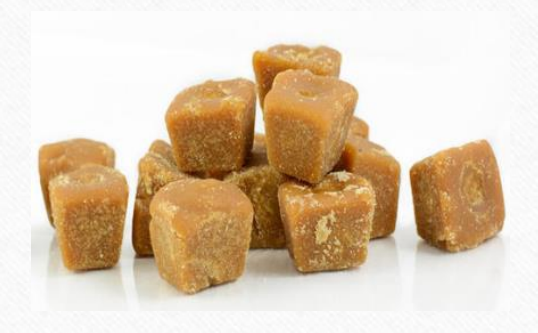
Jaggery Cubes 1/2kg, 1kg Jars