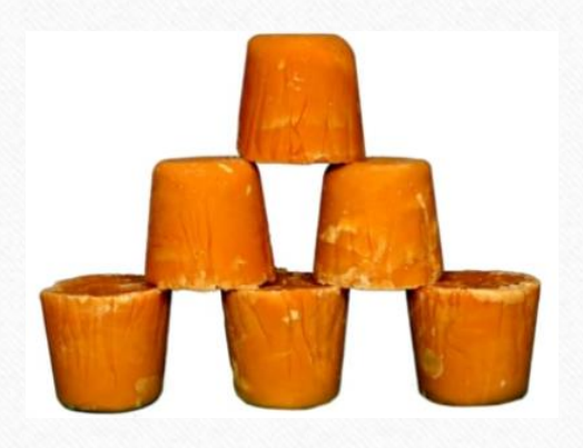
Jaggery Blocks 1/2kg, 1kg, 2kg, 5kg, 10kg, 20kg