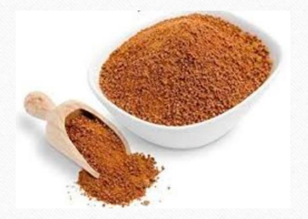
Jaggery Powder 1/2kg, 1kg Jars and Packets